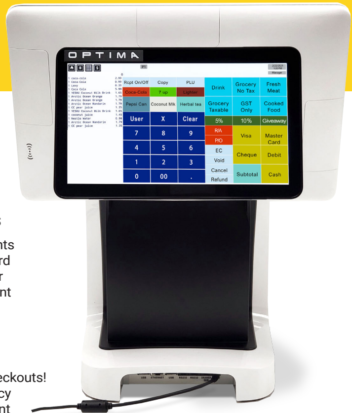
Back view Showing 10.1" Customer Display *Standard feature